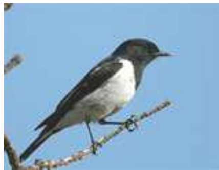
The Hooded Robin

Scarlet and Flame Robins have come down from the high mountains, and there are plenty of them enjoying the warmer atmosphere of our hills. Other robins you MIGHT see, are red-capped (they live in the inland, but sometimes disperse), The Hooded Robin is all black and white, and used to be quite common here, but I have not seen one for over 10 years. Quite common and a friendly bird, is the Eastern Yellow Robin. They sometimes come into gardens, (but not mine). Most of the female Robins are a nondescript grey-brown.