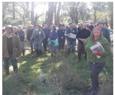
The day ended with a visit to the magnificent Hagen bogs down the Weibye Track.