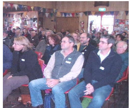
A packed hall listened to the latest research on our bogs.

To register your interest if you missed the day or for further information please contact Janet Hagen 57 904 268 jhagen@harboursat.com.au .