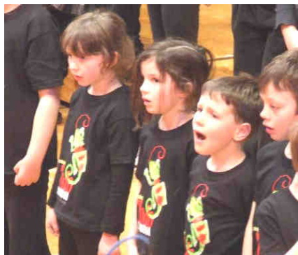
Some of the students from Highlands Primary School who performed in Melbourne as part of the Boite Choir.