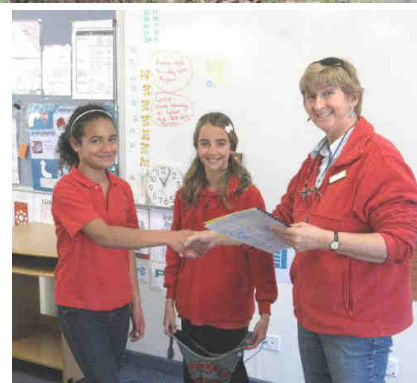
Prizes presented to some of the Children As Authors winners