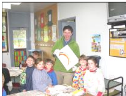
The army came to play games with our students as part of Exercise Jacka