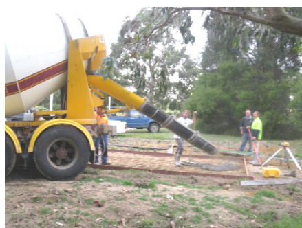
Our new sports equipment shed is starting at last!

10th March 3.30pm-5.30pm Yea Recreation Reserve Netball Rooms. Football and Netball will be offered for Under 12s, Under 14s and Under 16s All players must be financial members of the club. Under 18 - $70 Adult Single - $100 Family - $120 + $20 per playing member For further details contact Tom O'Dwyer 0407366643