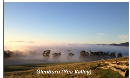
Glenburn (Yea Valley)

Over three generations, Graceburn Farm has aimed to create a balance between conservation, primary production and life-style on its 130 hectares (half a squatter's run).