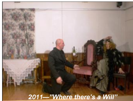
2011—"Where there's a Will"

I wrote a scene using characters from 'Sir Kenneth', which centred on finding alternatives for the word 'brown' to describe the appearance of Gerald, the grotty peasant. From the reading of that scene, sprang the idea of starting a local theatre group.