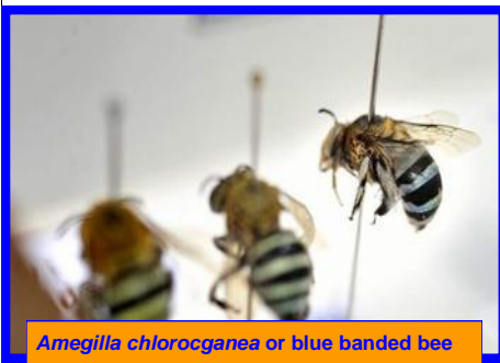
Amegilla chlorocganea or blue banded bee