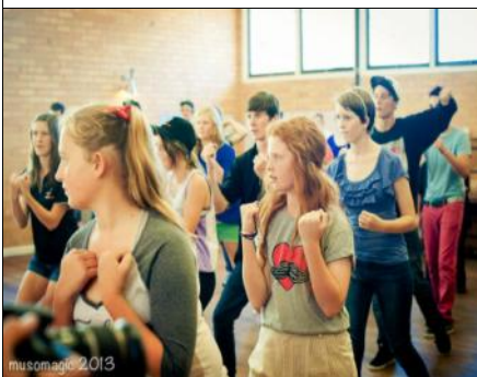
Young people from Yea High School and neighbouring shires rehearsing for the video