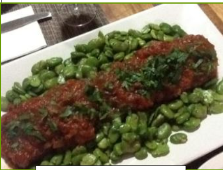
Goat Polpeton ( Meatloaf )

First course - a goat polpeton (meatloaf!) in tomato sugo with a side of broad beans sautéed in olive oil and garlic.