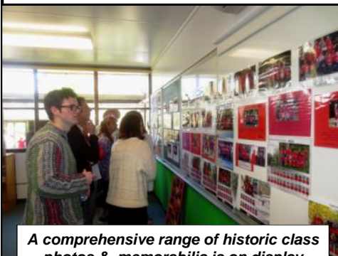
A comprehensive range of historic class photos & memorabilia is on display