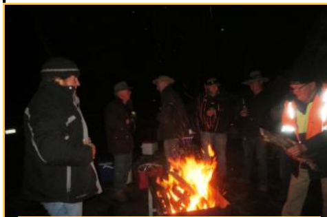
In winter the brazier is an essential component of Secret Men's Business gatherings

The first official Men's Shed was opened at Tongala, Victoria in 1998 and there are now 930 of them registered across Australia.