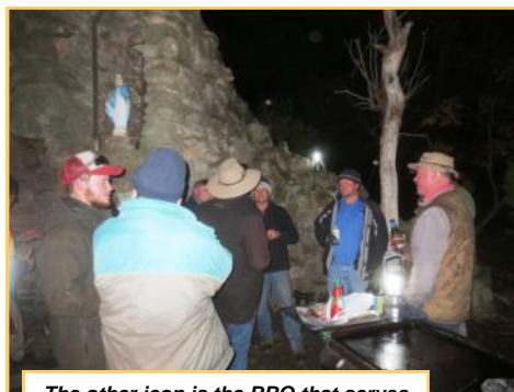
The other icon is the BBQ that serves up a simple sausage in bread

Whereas the official Men's Sheds demand a constitution, office-bearers, and a raft of compliance with safe operating practices; at Secret Men's Business there are no rules except that everyone should relax and enjoy a drink and a chat with mates and other blokes who they may not otherwise see from month to month.