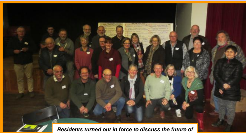
Residents turned out in force to discuss the future of the Ruffy Community Planning Reference Group

After two hours of robust but respectful discourse, the results were in.