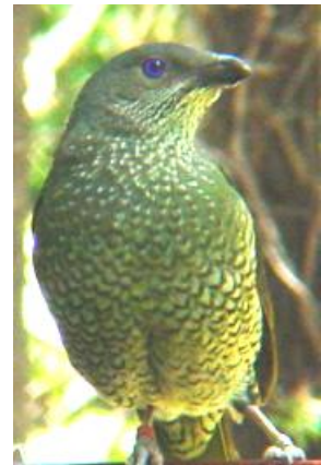
Satin Bowerbird, female.

I recently saw a bird list from Strathbogie in 1902: http://strathbogierangesnature-view.wordpress.com/2011/04/07/historic-bird-lists/ and was a bit surprised to see Satin Bowerbird listed – its normal habitat is damp forests. I have only ever seen any once at Caveat, and Peg Lade has seen them a couple of times in Highlands. The ones we saw weren't the glossy bright blue males that build the bowers and that most people would recognise. Males up to the age of 5 or 6 and females of any age are speckled green with brownish wings, and these are more likely than the mature males to wander into the drier bush during autumn and winter, returning in spring to the wetter forests where they breed. Thanks again to Louise Currie for taking the time to send us these articles, you are truly appreciated.