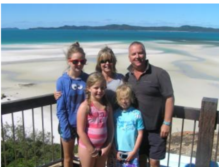
The Chapman family at Whitehead beach. Do you recognize the Highlands ex postie?