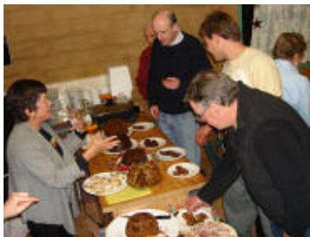
The Christmas pudding judges hard at work under instructions from Lu!

Ingredients 500gram sultanas 500gram sultanas 125gram sultanas 125gram mixed peel 125gram blanched almonds 125ml brandy (or enough to soak fruit and nuts in) 500gram butter 250gram white sugar 250gram brown sugar 8 eggs 500gram White Wings plain flour 250gram White Wings self-raising flour, pinch of salt 1 small teaspoon of bicarb soda Method Mix all fruit, chop peel and almonds and pour the brandy over them. Cover and leave to stand for 24 hours. Cream butter and sugars gradually add beaten eggs then sifted flours, fruit mix and drying ingredients, mixing thoroughly. This can be steamed in a greased basin, securely covered with four well-greased thicknesses of paper or boiled in a cloth. Both methods requires six hours of cooking and on the day of use a further two hours. Enjoy!