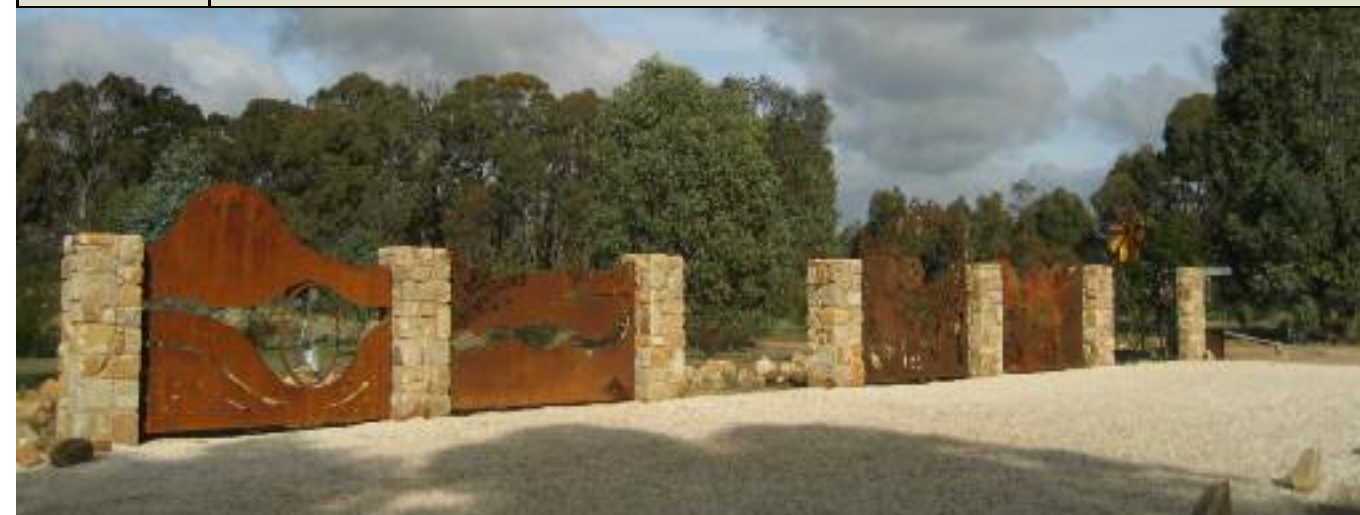
THE NEW SCULPTURE WALL AT THE EUROA ARBORETUM