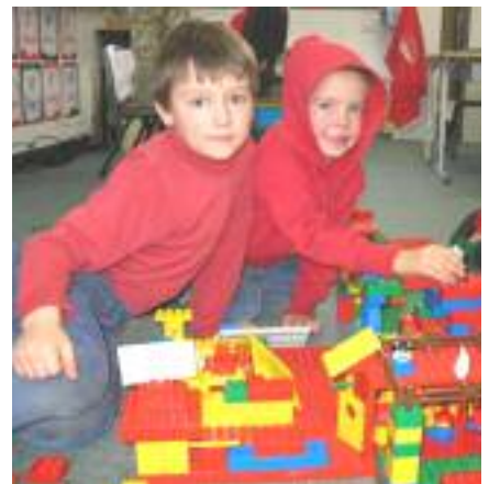
Thursday afternoon Rotating Activities.

Major works will begin over the school holidays. The outdoor area will be refurbished, outdoor seating relocated, windows will be fixed and preparation for the new building will start. This could be disruptive for several months