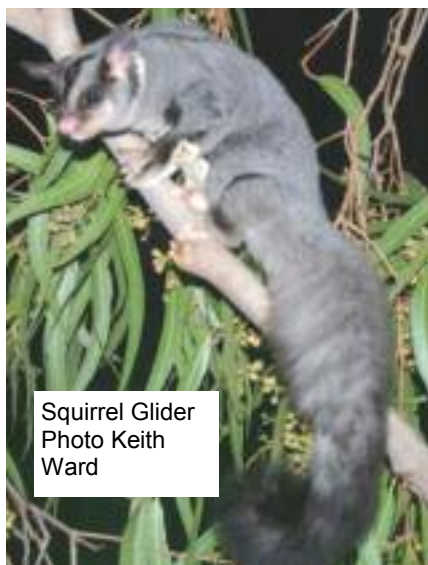
Squirrel Glider