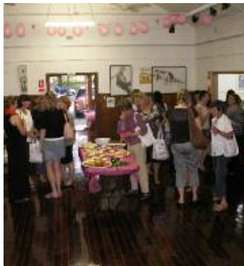
Photo below A successful evening for the “Girls Night In” last Saturday night.

All students in our school will be allocated a VSN. It is a student identification number that is being assigned to all students in government and non government schools and students in Vocational Education & Training Institutions. The number, which is unique to each student, will be used as a key identifier on a student’s school records, and will remain with the student throughout their education, until reaching the age of 25. You will see the VSN on student reports, enrolment confirmations & exit confirmations. If you want to know more about the VSN please see http://www.education.vic.gov.au/management/governance/vsn/overview.htm