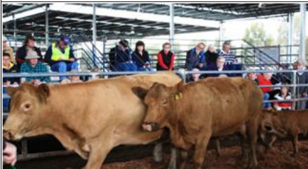
Crystal Creek Gelbviehs at Yea Dispersal

The Yea Saleyards has held its first stud sale with the dispersal of the Crystal Creek Gelbvieh Stud, which operates out of Alexandra.