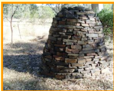
The newly discovered Whiteheads Creek Pinniger Cairn

The most recently discovered Cairn is in excellent condition, but Pinniger's reasoning for locating it in the lowlands at Whiteheads Creek remains a mystery.