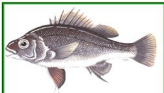
THE SEARCH For THE PERCH

Would it be mischievous to suggest that perhaps there's another non-consultative plan afoot to clear the native vegetation along the roadsides leading to the Ruffy Neighbourhood Safer Place ?