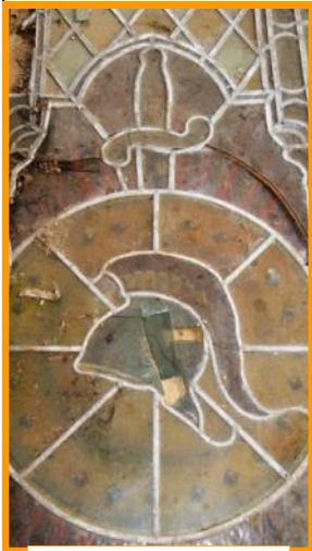
One of the Panels of the 'Charlton Window'

Contemporary renovations to the Anglican Church in Euroa, Victoria, unearthed a three-piece leadlight window which had not seen the light of day in over a century. Covered in layers of dust, leaf litter, possum and rodent droppings, the window is both a significant example of early 20 th century glass craftsmanship and an artefact showing how unique responses to loss, mourning and commemoration were, in the past, enacted.