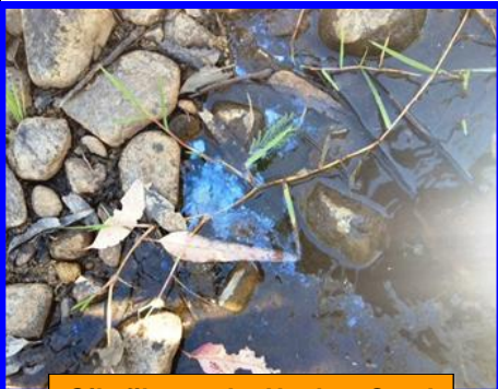
Oilly film on the Hughes Creek