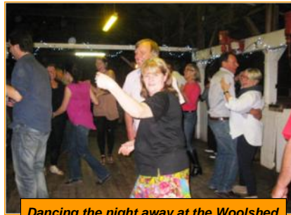
Dancing the night away at the Woolshed

A special mention to all the Highlands PS families who contributed in some way to the success of the event.