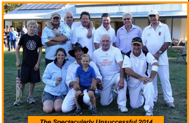
The Spectacularly Unsuccessful 2014 Wilderness Cricket Team