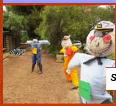
Some scarecrows were scarier than others