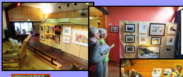
The Ruffy Hall Gallery hosted an eclectic exhibition chock full of art, craft and sculpture