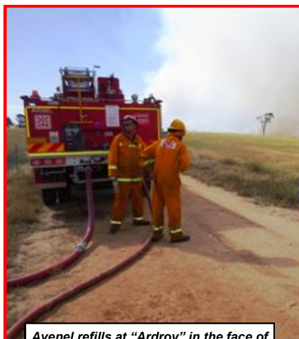
Avenel refills at "Ardroy" in the face of the rapidly moving blaze