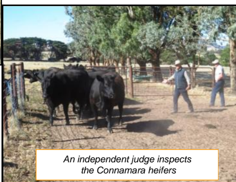
An independent judge inspects the Connamara heifers

Over 100 Victorian beef breeders take up the Heifer Challenge and Connamara is a regular entrant.