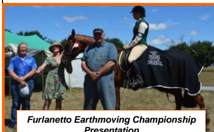
Furlanetto Earthmoving Championship Presentation

There are not many events like this around these days but the small determined committee work hard and the Ruffy Rec Reserve was a picture.