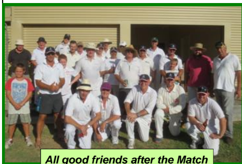
All good friends after the Match