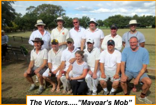
The Victors....."Maygar's Mob"

Maygar's Mob, although it looked like being consumed by a reverse takeover of Fowles proportion, was topically made up of imported and Australian products.