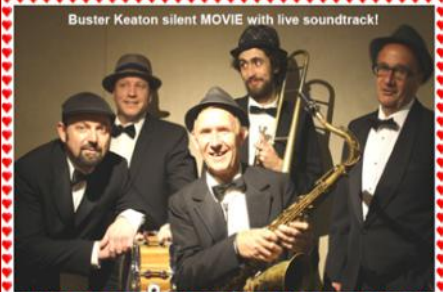
Buster Keaton silent MOVIE with live soundtrack!