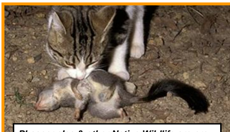
Phascogales & other Native Wildlife are prey

Feral cats have no economic value. The cost of feral cat management and research has been estimated at $2 million per year nationally. The economic loss inflicted by feral and domestic cats, based on bird predation alone, has been estimated at $144 million annually.