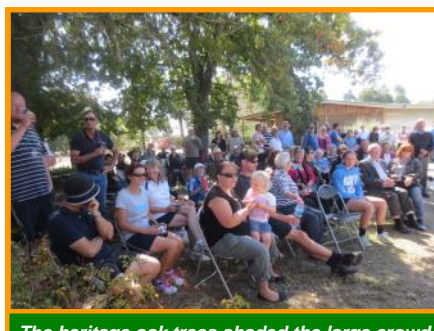
The heritage oak trees shaded the large crowd