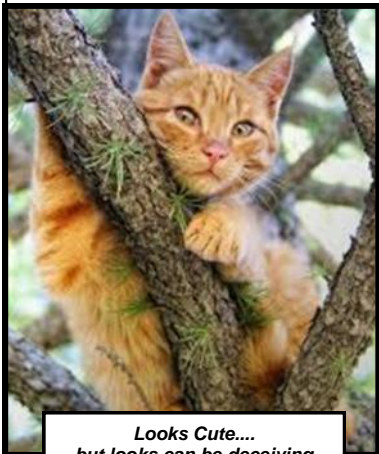
Looks Cute.... but looks can be deceiving

Feral cat populations began to establish in Australia soon after European arrival, as early as the 18th century.