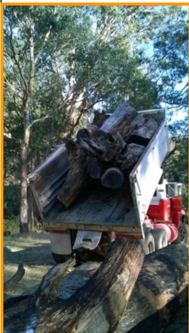
Unloading timber at a habitat pool

"Several truck & trailer loads of salvaged timber from the Creighton's Creek fires have been taken to 3 degraded habitat pools suitable for Macquarie perch,"