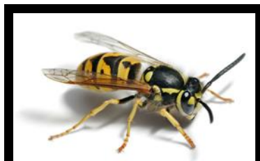
The European wasp Vespula germanica

Tracking single wasps back to the nest is very time consuming.