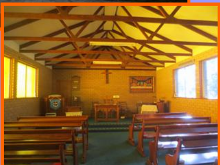
By Don Cook