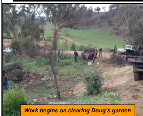
Work begins on clearing Doug's garden