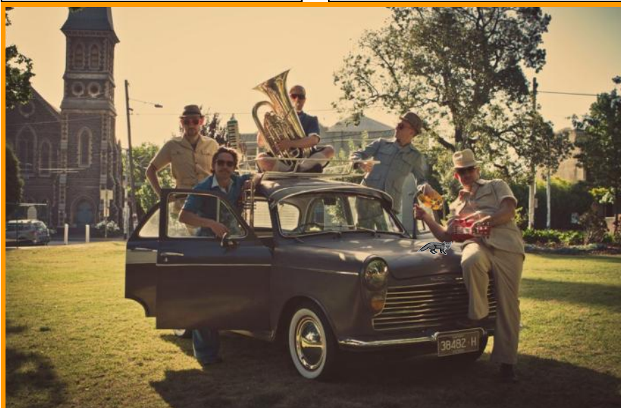
'TIJUANA PEANUT' will perform live at RUFFARTZ on November 28th

FINDING FOXY Issue 38 2015 Treefox Page 4