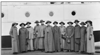
Twelve Nurses from Victoria from the No2 Hospital Ship 'Kanowna'

There has been enormous interest within the Australian community to research, record and remember the stories of the thousands of young men and women who left this young country to fight for their King 100 years ago.