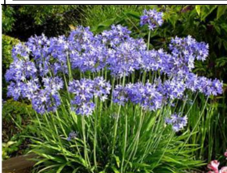
Agapanthus praecox subsp. orientalis