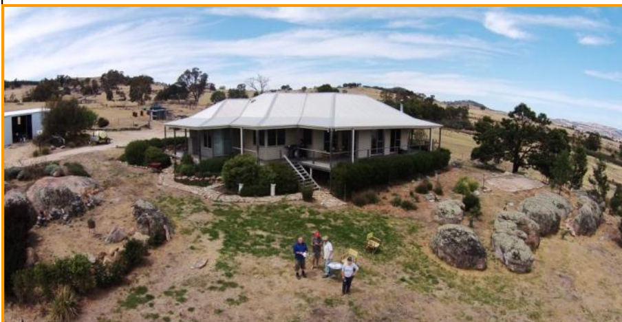
At an elevation of 150 feet the drone's field of view and resolution are stunning