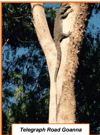
Telegraph Road Goanna

Did you know we have Goannas right here in our own neighbourhood? They are living in Seymour Bushland Park, the Golf Course and moving along Whiteheads Creek and Telegraph Road. Not so long ago I saw two resting on one tree!