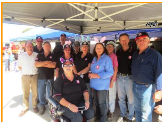
The Ruffy CFA 'Good Friday' Team

However, the deeper community benefit is the opportunity for people to come together on common ground, enjoy a catch-up chat and get to know newer members of our vibrant and unique district.