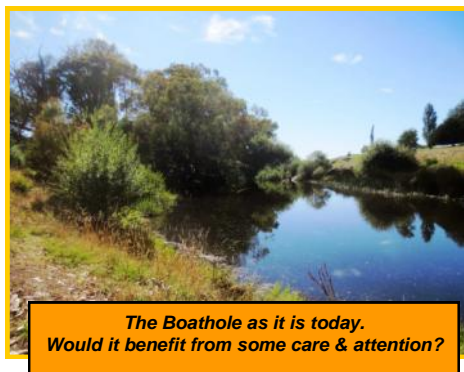
The Boathole as it is today. Would it benefit from some care & attention?