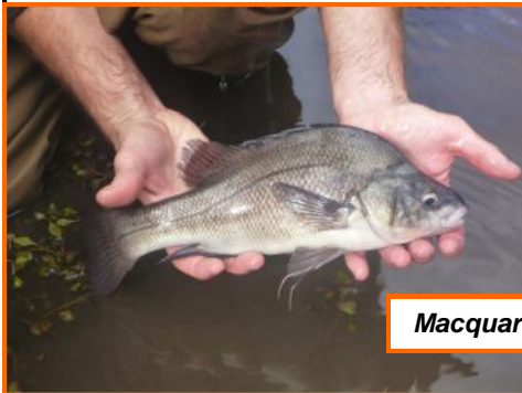
Macquarie perch being returned to stream

Seven of the eleven remaining populations of Macquarie perch ( Macquaria australasica ) in Victoria are found in the Goulburn Broken catchment. The populations that remain are fragmented and vulnerable. Drought and climate change increase the pressures on their survival.