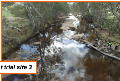
Habitat enhancement works at trial site 3

Focus is on enhancing in-stream habitat and connectivity to extend the size and range of the Macquarie perch population downstream.