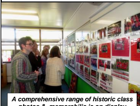
A comprehensive range of historic class photos & memorabilia is on display