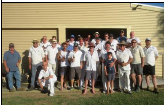
Highlands vs Ruffy—A game always played in great spirit

Best fielder for the Highlands had to be the bloke who owned the bus out in the caravan park, who kept returning the ball every time someone from Ruffy hit it through his window. At one stage the roof of the bus was discussed as a possible fielding position until it was pointed out we shouldn't tempt Marcus to try and hit over it.