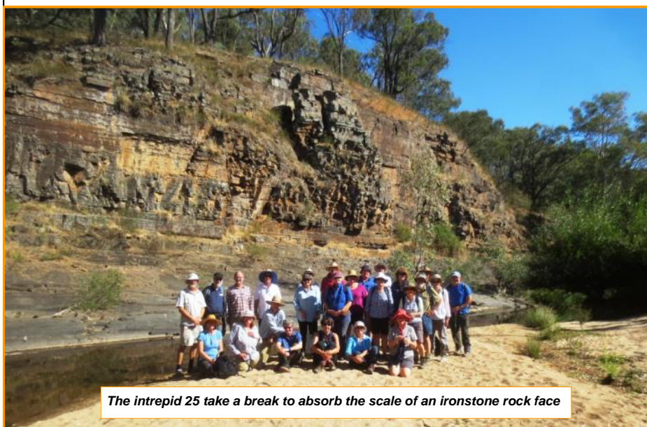
The intrepid 25 take a break to absorb the scale of an ironstone rock face