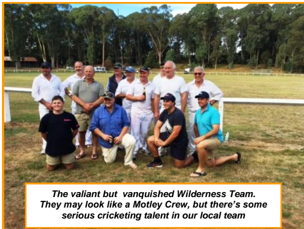
The valiant but vanquished Wilderness Team. They may look like a Motley Crew, but there's some serious cricketing talent in our local team