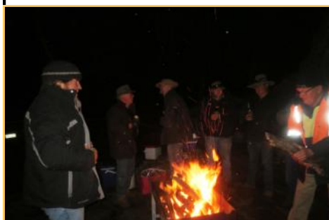
In winter the brazier is an essential component of Secret Men's Business gatherings

The first official Men's Shed was opened at Tongala, Victoria in 1998 and there are now 930 of them registered across Australia.