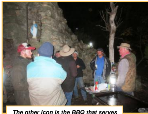
The other icon is the BBQ that serves up a simple sausage in bread

Whereas the official Men's Sheds demand a constitution, office-bearers, and a raft of compliance with safe operating practices; at Secret Men's Business there are no rules except that everyone should relax and enjoy a drink and a chat with mates and other blokes who they may not otherwise see from month to month.