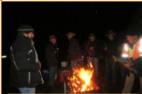
In winter the brazier is an essential component of Secret Men's Business gatherings

The first official Men's Shed was opened at Tongala, Victoria in 1998 and there are now 930 of them registered across Australia.