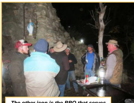
The other icon is the BBQ that serves up a simple sausage in bread

Whereas the official Men's Sheds demand a constitution, office-bearers, and a raft of compliance with safe operating practices; at Secret Men's Business there are no rules except that everyone should relax and enjoy a drink and a chat with mates and other blokes who they may not otherwise see from month to month.